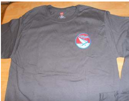
front of shirt

WSSA long sleeve t-shirts, $25.00 each plus shipping. Choice of three colors – charcoal, medium blue, and forest green. A colored WSSA logo is on the left side of chest, a stern steerer in a tall hike (thanks to Jeff Seeboth for the pose) is on the back. Send t-shirt orders to WSSA Secretary/Treasurer.