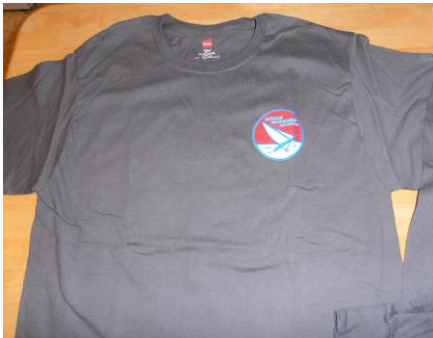
front of shirt

WSSA long sleeve t-shirts, $25.00 each plus shipping. Choice of three colors – charcoal, medium blue, and forest green. A colored WSSA logo is on the left side of chest, a stern steerer in a tall hike (thanks to Jeff Seeboth for the pose) is on the back. Send t-shirt orders to WSSA Secretary/Treasurer.